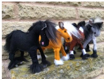
Felt art Native Ponies just a small example of some of the craft available.

Or if you have a birthday or anniversary coming up, and don't want to risk the shops we have some wonderful craft available. Normally we would be selling at local shows and events, but much of our craft can be posted out. Treat someone to an original, individual and beautiful gift, prices start from just £3.00. Contact Chris for more details.