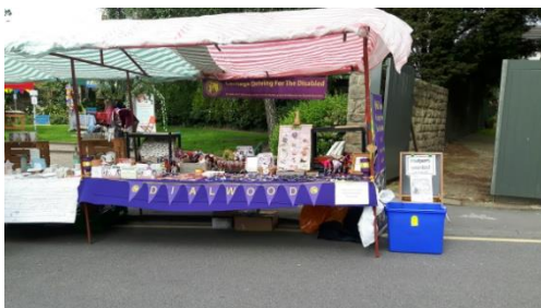
Our Colourful stall at Horbury Street Fair