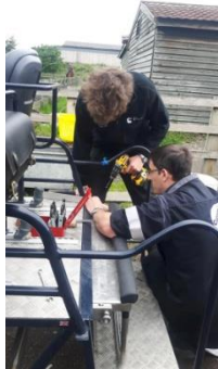
Two of Cummins Engineers make a few final checks

tested by an independent engineer and Jo Pilling it is hoped that this new ramp will also increase our client base.